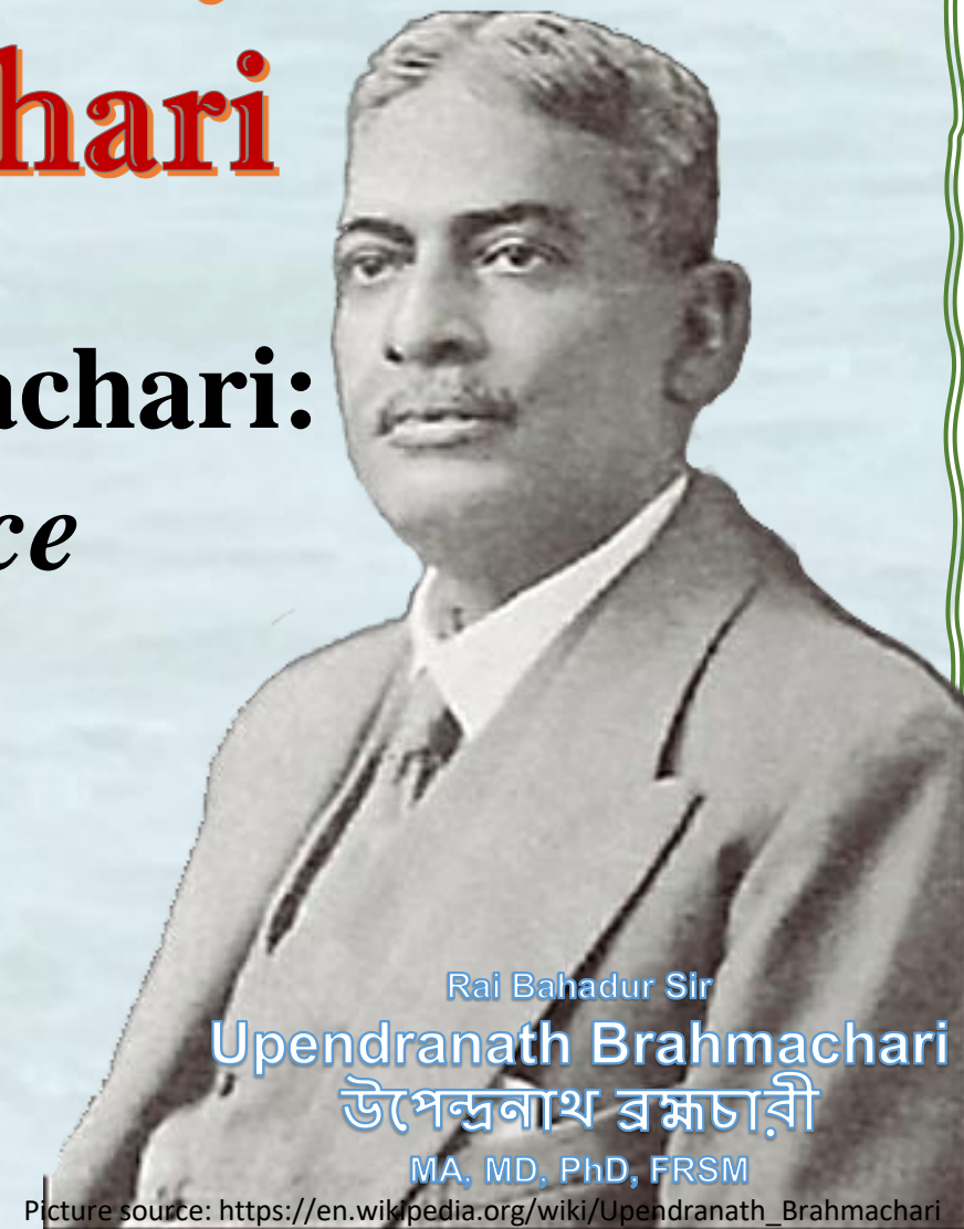
Rai Bahadur Sir

PhD, MIPHA, FRSPH (London) Team Lead, COVID-19 Research Trackers – UNESCO, New Delhi